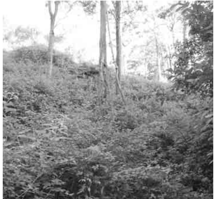
Bushland area before regeneration