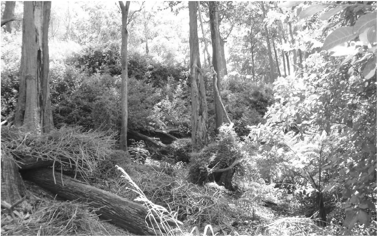
Bushland area after regeneration