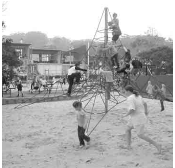
Despite the downpour the children wasted no time in making use of the new facilities

Unfortunately vandalism and graffiti are the curse of all communities these days and too much of the Council's precious financial resources are wasted in repairs and clean-ups and so the community is being asked to be vigilant and report any incident to police and/or Council as soon as possible.